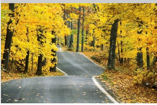
M-119's scenic "Tunnel of Trees" attracts motorists and non-motorized visitors.

M-119's scenic "Tunnel of Trees" is enjoyed by many people—full time and seasonal residents, visitors, and vacationers, and those who travel the corridor in automobiles, motorcycles, or bicycles to revel in its natural beauty.