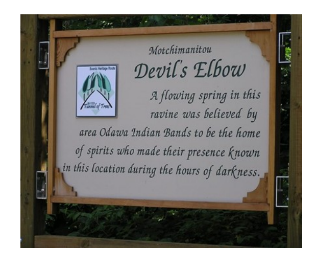
Devil's Elbow is one of the historic locations along the M-119 corridor which is marked by signage.