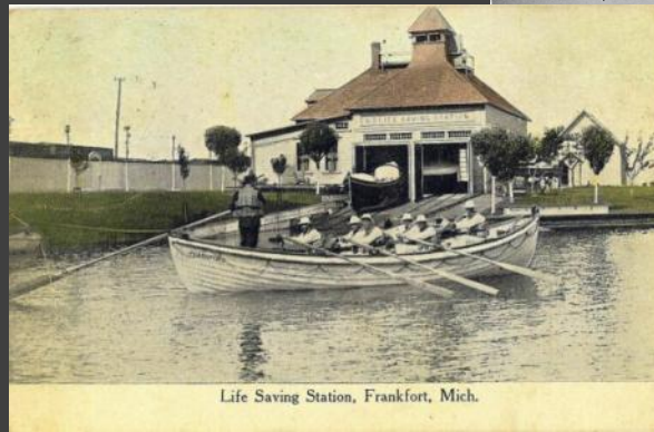
Life Saving Station, Frankfort, Mich.

Abandoned by Coast Guard in 2004 when a new station was built just west of the original station.