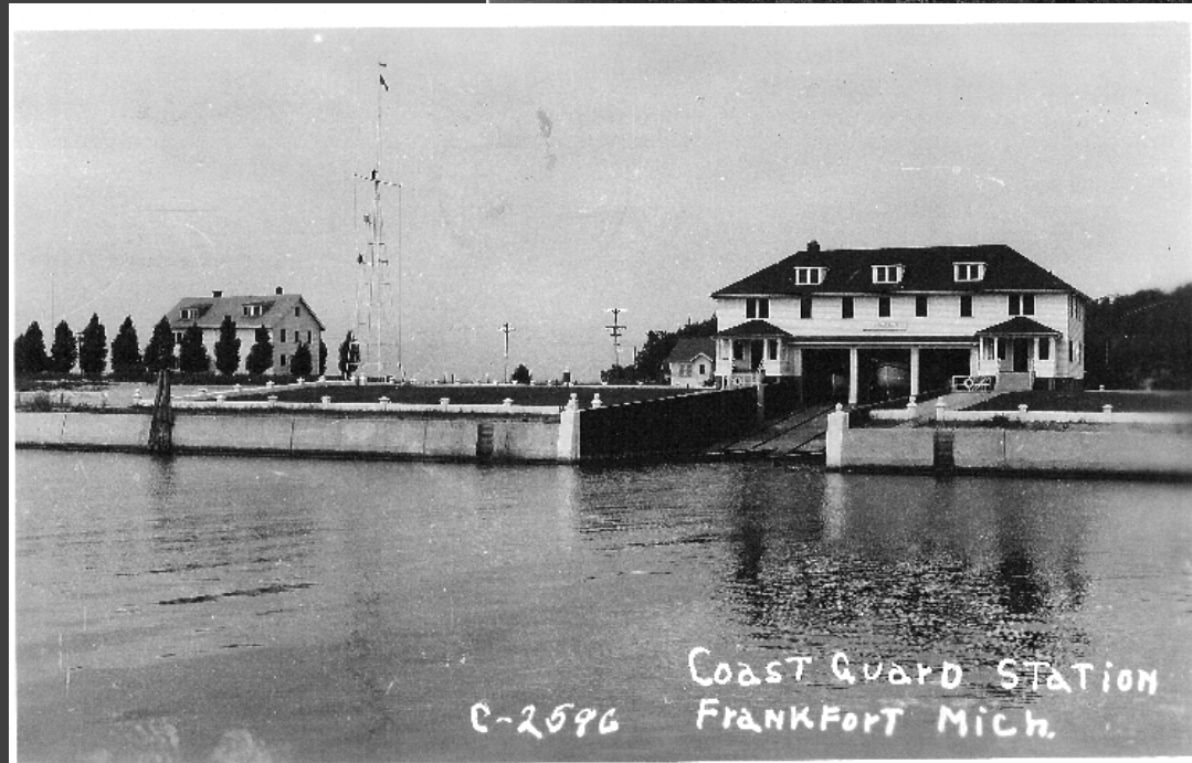
C-2596 COAST GUARD STATION FRANKFORT Mich.