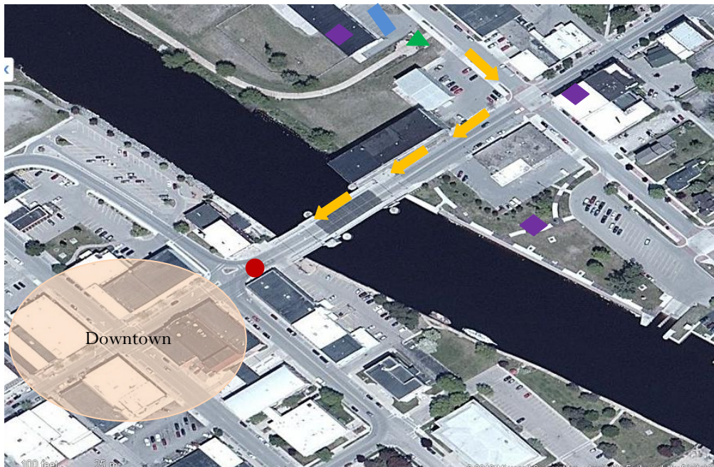
Trail Town Design Issues

Nodes: Picture (A) shows a bicycle shop in downtown Grayling. Picture (B) shows a tour boat loading area along the Great Lakes Maritime Heritage Trail in Alpena. Picture (C) shows the River Raisin Heritage Trail as it passes in front of the River Raisin National Battle Field in Monroe.