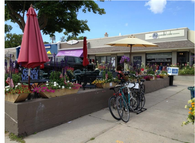
Suttons Bay, MI